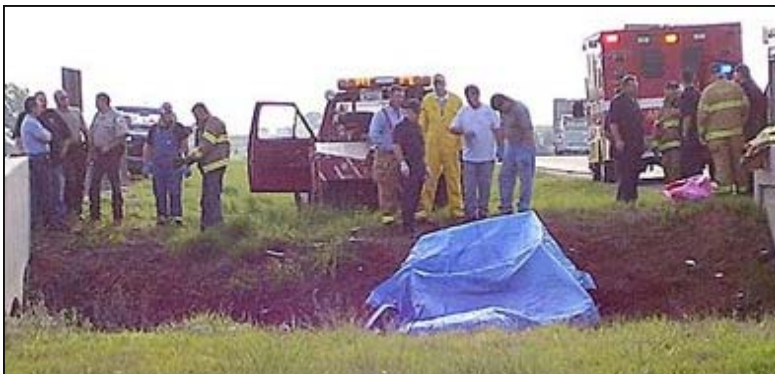
Rescue personnel stand along I-40 near Canute, OK as a tarp covers the wreckage of a single-vehicle accident in which 7 persons were killed.

From Tulsa's KRMG, Debra Woodall had the story when a man was shot and critically wounded in a drive-by shooting outside a Tulsa convenience store dies.