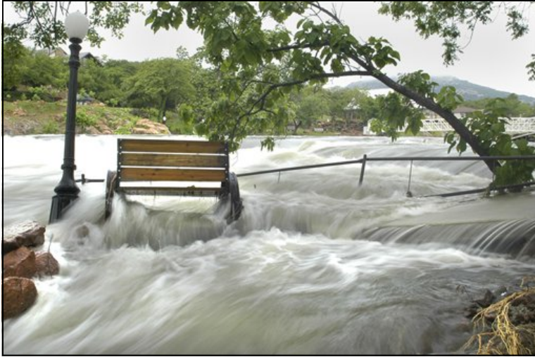
The normally tranquil Medicine Creek is shown after torrential rains and the opening of nearby flood gates sent water rushing through the creek.