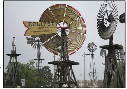
A portion of the exhibits at the Shattuck, OK, Windmill Museum.

From the Woodward News came a feature about a museum dedicated to windmills, including displays explaining the history and likely future of the devices.