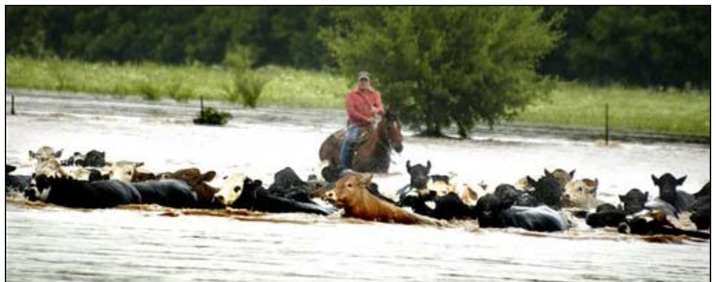
Cowboys on horseback were forced to herd about 140 head of steer through swirling floodwaters to safety on the far bank in northwest Cotton County.