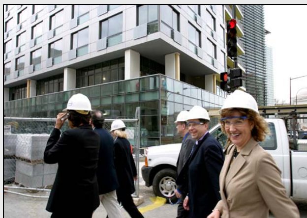
APME leaders on a hard-hat tour of the new Newseum

http://marriott.com/property/propertypage/wasiw?groupCode=apmapma&app=resvlink