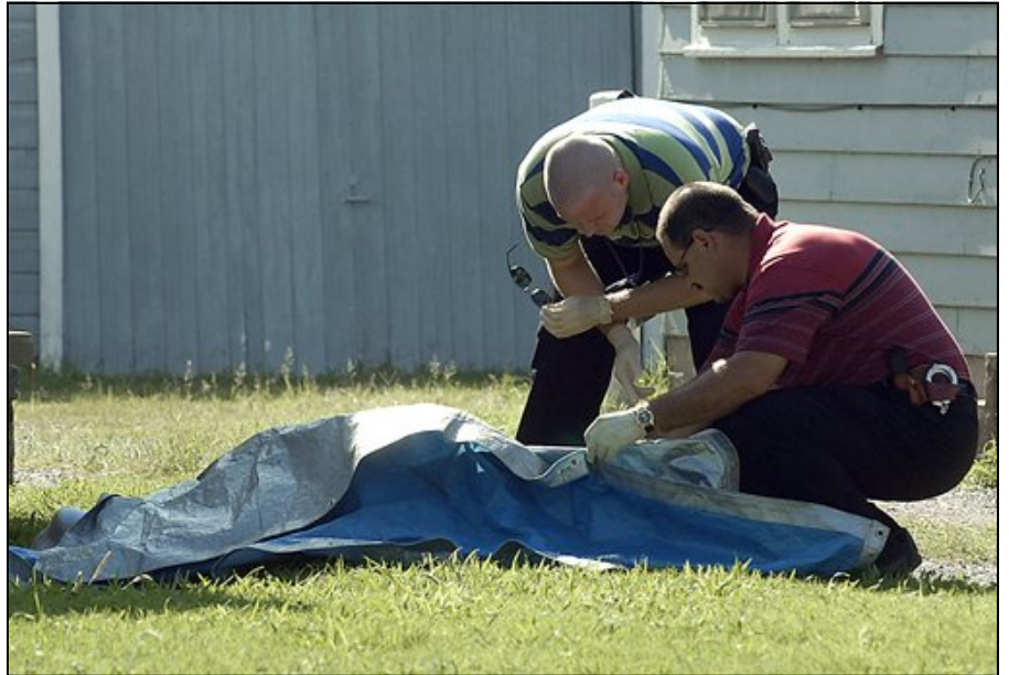
Police detectives examine a body at an apparent double homicide crime scene in Enid, OK.