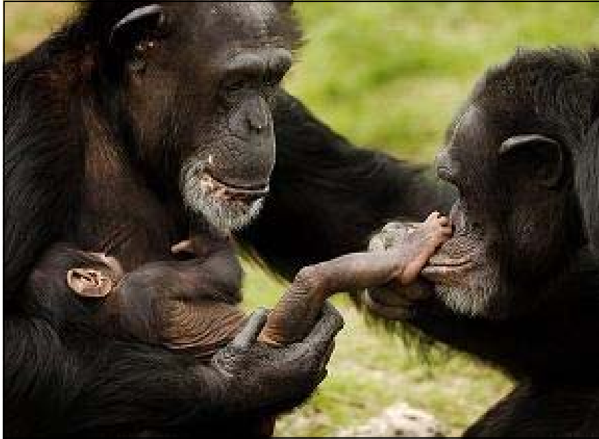
1st Place: (Above) Alvin, right, the father and Jodi, the mother, interact with their 1-month-old baby chimpanzee at the Tulsa Zoo on March 21, 2007, in Tulsa, Okla.