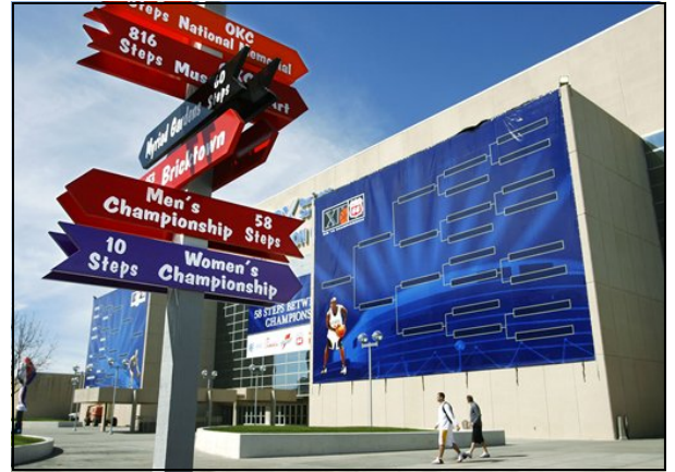
Big 12 College basketball tournament bracket banners, March 5, Oklahoma City.

The Muskogee Phoenix provided a story about a 3-year-old child who left home and wandered the streets until a passing motorist spotted him.