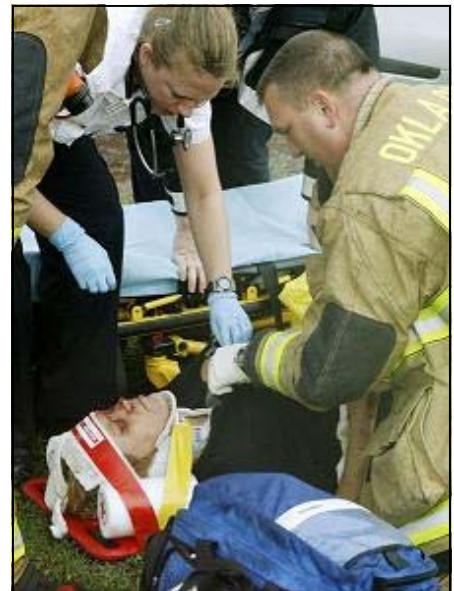
3rd Place: (Above) Rescue workers treat a woman that was in a recreational-vehicle trailer that was sent airborne during a tornado in west Oklahoma City, Thursday, March 29, 2007. A tornado moved through northwestern Oklahoma City Thursday, injuring at least four people, including a 7-year-old girl and a couple critically hurt when their travel trailer was destroyed.